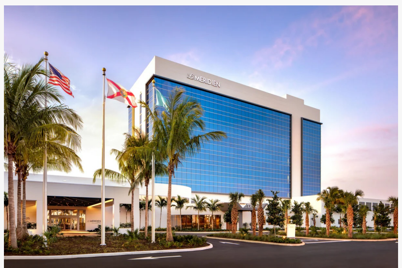
Le Méridien, Dania Beach, FL is the Fin+AI 2024 Conference Host Hotel