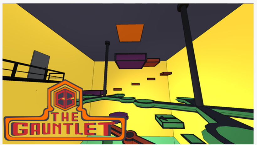
The Gauntlet Screen Shot

“The Gauntlet” is based on an imaginary Game Show hosted by a notorious evil mastermind known as Bad Bat. As one of the new contestants, players race through obstacle courses all of which have been designed with their demise in mind. Similar to parkour they have to make it