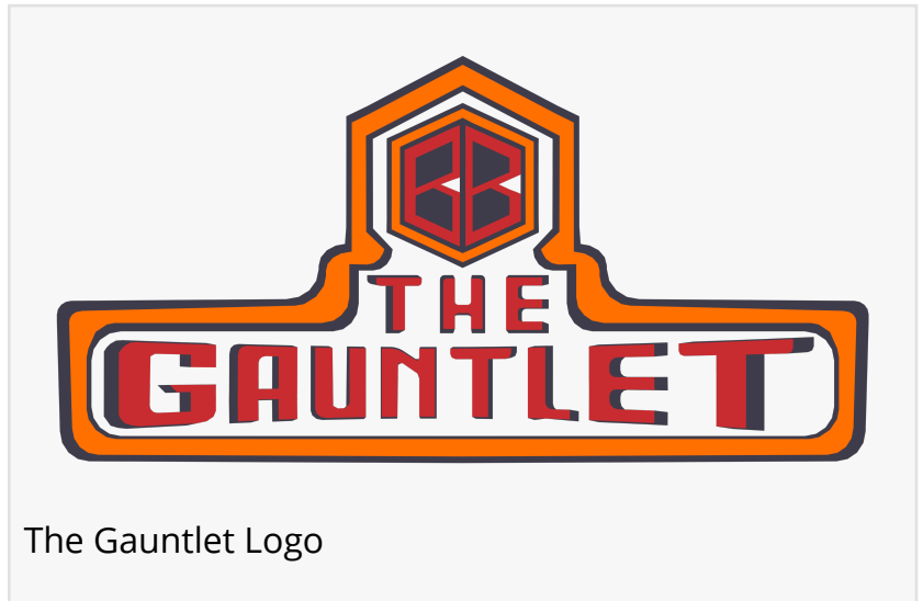
The Gauntlet Logo