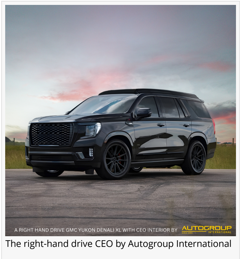
The right-hand drive CEO by Autogroup International

COLOMBO, SRI LANKA, February 11, 2024 /EINPresswire.com/ -- Autogroup International , the leader for 30-years in right-hand drive vehicle conversion and luxury transformation, has announced the release of their latest creation – the right-hand drive 2024 'CEO' Yukon Denali XL with its 'private jet' style luxury rear cabin. This luxury SUV boasts a bespoke rear cabin interior, including a 4.5" raised roof, Rolls Royce style starlight headliner, a pair of premium Maybach-style captain's chairs, and a sliding privacy partition with a 40" HD TV.