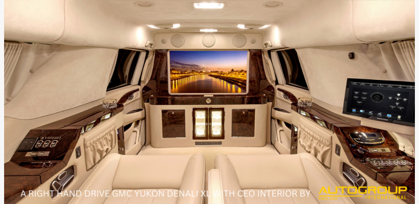
Autogroup's CEO SUV - Luxury Interior