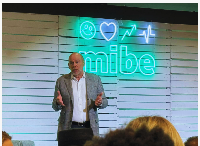
The MIBE Summit in Denver, CO.

BENTON, ARKANSAS, UNITED STATES, February 11, 2024 /EINPresswire.com/ -- Vibrant Occasions proudly announces its participation in the highly-anticipated Make It Better Everyday (MIBE) conference called The MIBE Summit which took place January 21-23, 2024 in Denver, Colorado. The event focused on heart leadership and continuous improvement within the hospitality industry, providing a transformative experience for professionals and thought leaders exploring these principles.