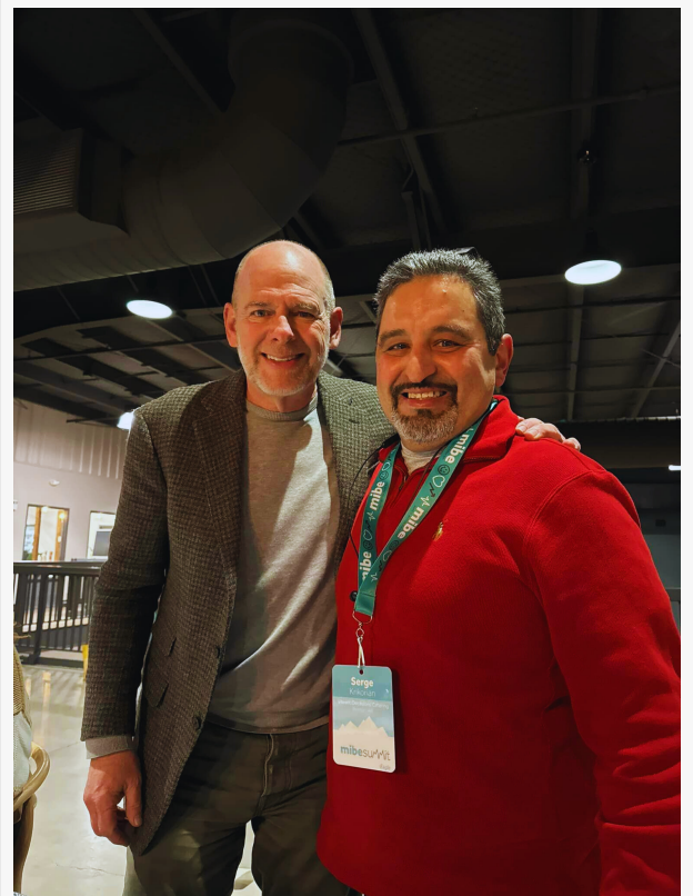
The MIBE Summit in Denver, CO.