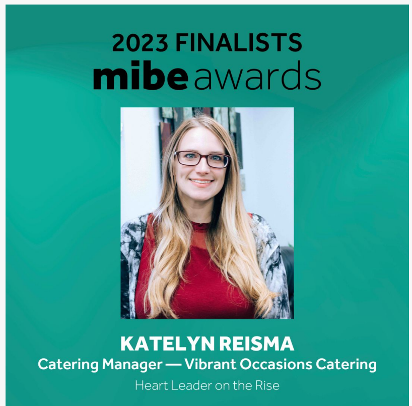
The MIBE Summit in Denver, CO.