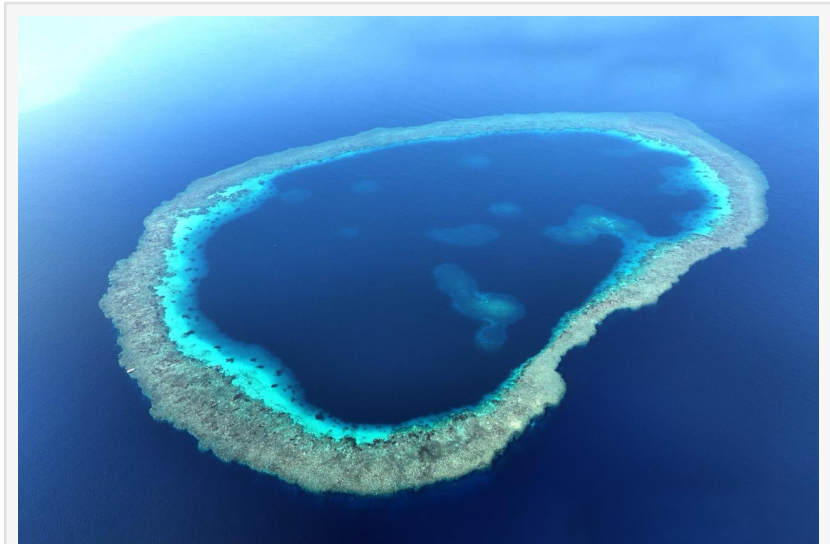
Saudi Blue Holes

Among the multitude of revelations, the discovery of several mesmerizing Blue Holes, each fostering unique ecological systems, and the first-ever identification of great white sharks in the Red Sea through DNA analysis, stand out