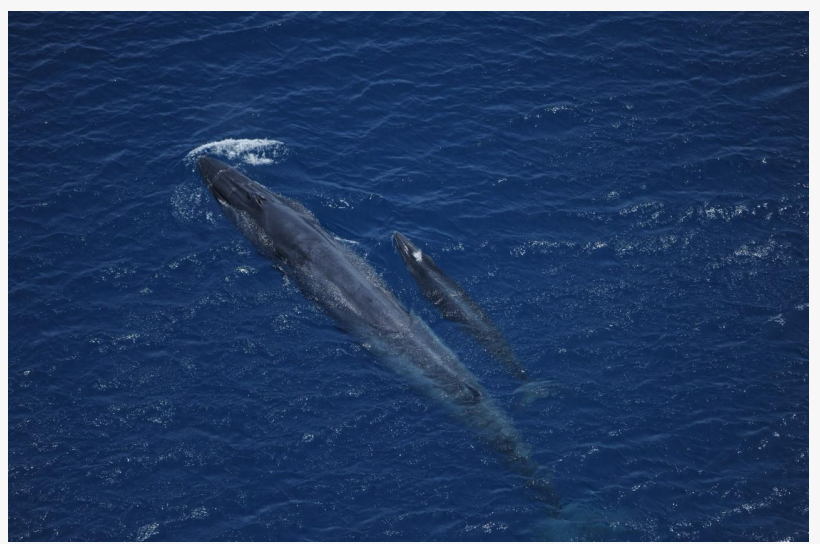
Bryde Whales in the Red Sea, Blue Holes, Image provided the Saudi National Center for Wildlife

The expedition's researchers documented the remarkable ability of several sharks to dive to exceptional depths in the Red Sea, navigating waters at a record low depths, likely enabled by the unusually warm temperature at depth in the Red Sea, which hovers around 21 degrees Celsius. Additionally, the discovery of a thriving community of deep-sea lantern fish, displaying remarkable density and resilience to extremely low oxygen conditions, has revealed the Red Sea's captivating marine ecosystem in unprecedented detail.