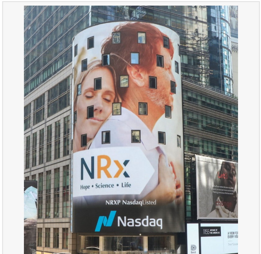
$NRXP on the NASDAQ

□ NRXP Eligible for Additional $324 Million in Development & Sales Milestones, Plus Double-Digit Royalties Upon Approval and Commercialization of NRX-101.