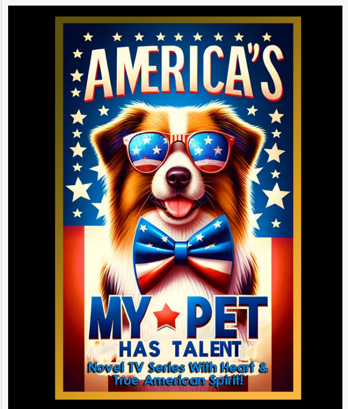
America's My Pet Has Talent

A highlight of the series is the "Save A Pet Telethon," inspired by the iconic Jerry Lewis Telethon. This segment, led by celebrated animal activists, underscores the vital need for animal adoption and honors the tireless efforts of shelters, adoption centers, and rescue organizations. Through a mix of dynamic entertainment and compelling stories, the telethon galvanizes viewers to