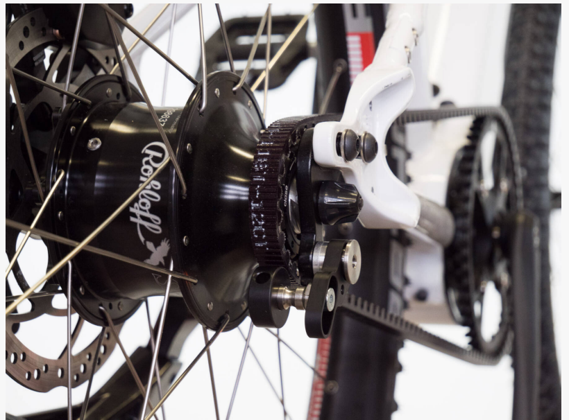
Rohloff 14 Speed Internal gear hub with 520% gear range