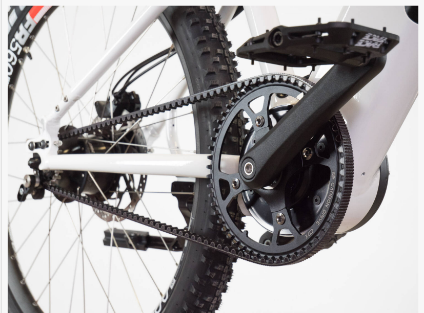
Gates Belt Drive for low maintenance and oil free riding