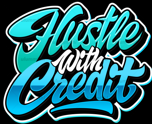
Hustle With Credit