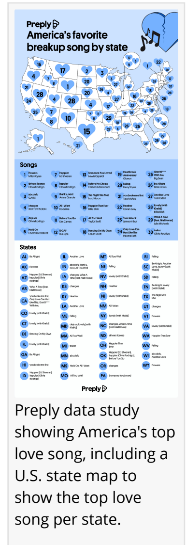
Preply data study showing America's top love song, including a U.S. state map to show the top love song per state.

Using search trends data, Preply determined which songs are the most popular across each U.S. state to reveal how each region shows their emotions through music. Key findings include: