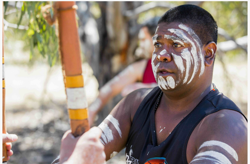
The Lake of Scars - Still 2

LOGLINE/Short Synopsis: In a remote part of Australia exists a place of astounding beauty and rare archaeological and environmental significance. On the verge of being lost forever, an unlikely partnership could see it saved.