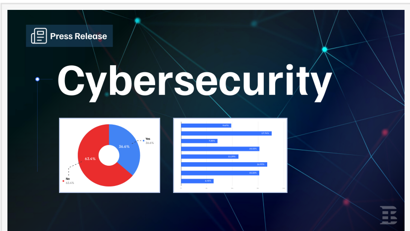
TechBehemoths cybersecurity press release

Insider threats (26.2%) and IoT attacks (17.4%) are the least worrisome threats on the list.