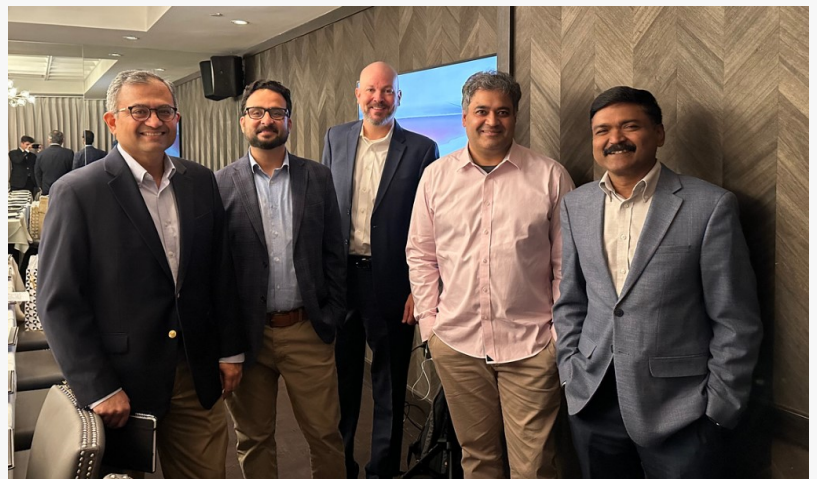
$HCTI Team Healthcare Triangle