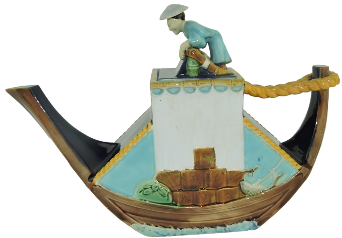
George Jones teapot, the angular body formed as a Chinese junk filled with cargo, the spout formed as the helm, one of only two known (est. $20,000-$25,000).