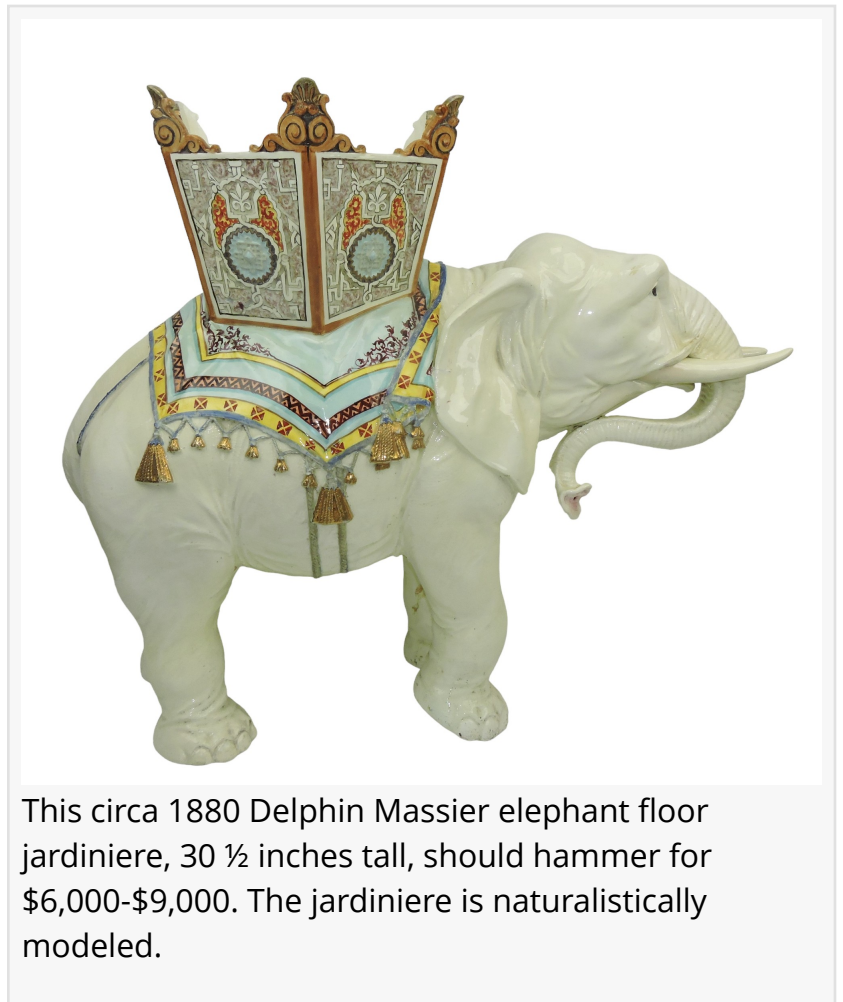
This circa 1880 Delphin Massier elephant floor jardiniere, 30 ½ inches tall, should hammer for $6,000-$9,000. The jardiniere is naturalistically modeled.