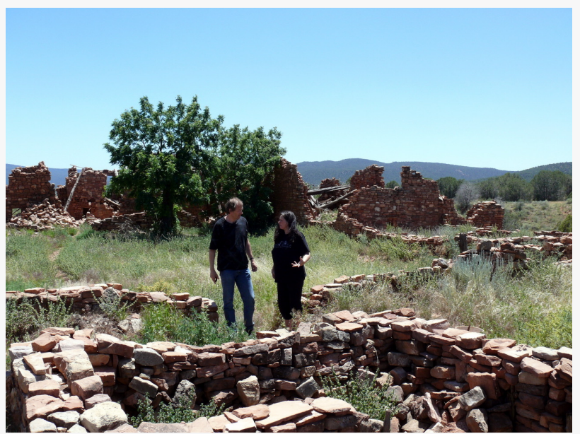
Kinishba is named for an ancient pueblo on the White Mountain Apache Reservation.