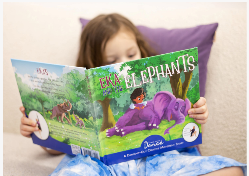
Caught Reading "Eka and the Elephants"