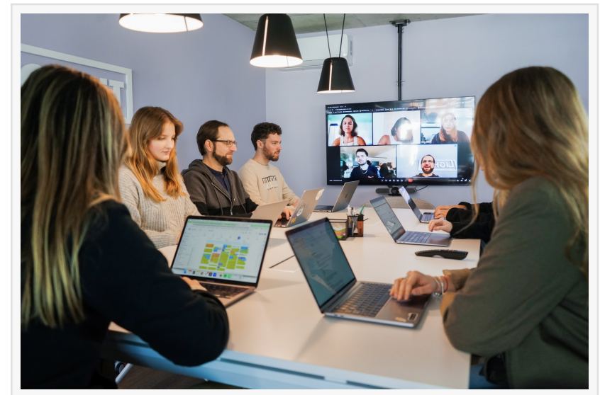
Light-it development team working in a meeting room

focuses on leveraging artificial intelligence (AI) and Large Language Models (LLMs) and aims to streamline healthcare procedures by employing state-of-the-art technologies, making them more effective and patient-centric. Making healthcare LLMs 10x more intelligent and human, Puppeteer offers a platform that enables any healthcare company to construct AI agents with unparalleled human-like capabilities in just days.