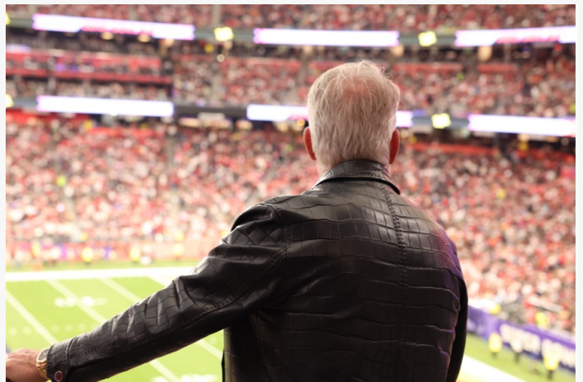
Thomas J. Henry

This press release can be viewed online at: https://www.einpresswire.com/article/688890728