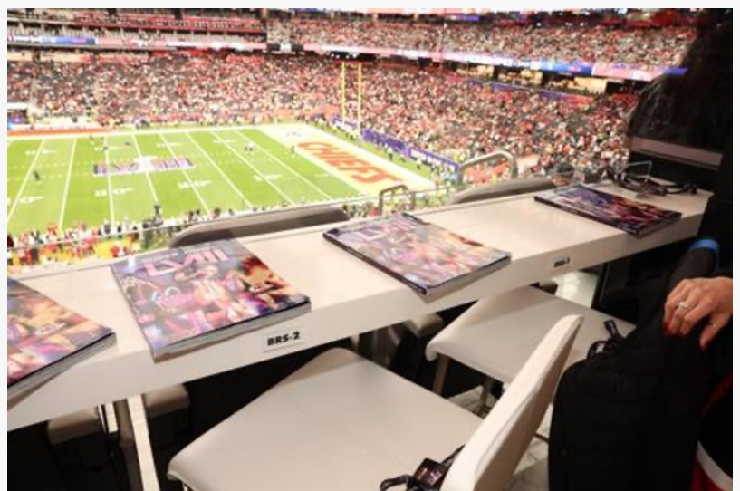
Atmosphere - View from Suite at Allegiant Stadium