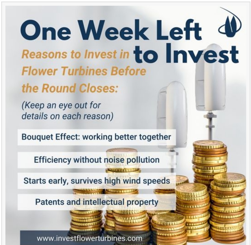
One Week to Invest in Flower Turbines

Flower Turbines' small-scale, aesthetically pleasing wind turbines are designed to start at low wind speeds, thrive in high winds, and actually boost each other's performance when