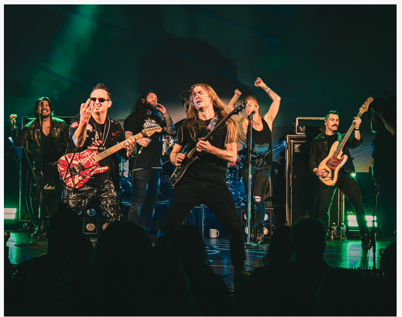
A.D.A.M. Music Project live at Tower Theater in Oklahoma City, OK

You can check out some of the live performances of A.D.A.M. Music Project by checking out their