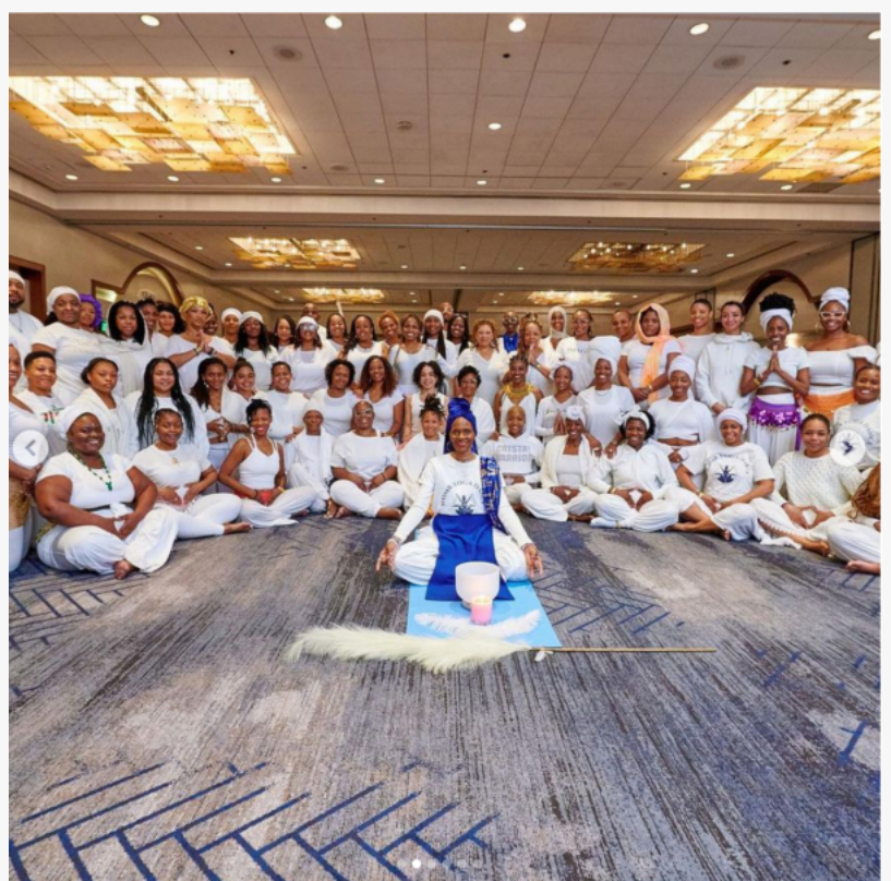
Ascending Class Of Sacred Woman Rites Of Passage Program In Los Angeles, CA

This press release can be viewed online at: https://www.einpresswire.com/article/688974144