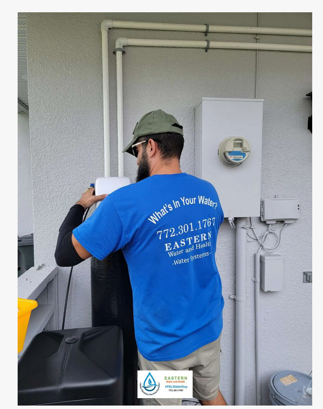
Benefits Of Water Filtration System

Adding Hydrogen Peroxide to a Hydrogen Injection System - Hydrogen Peroxide- 7% Hydrogen peroxide works faster than chlorine with no chemical residue or byproducts. This treatment option does not affect the taste of the water and minimizes bacteria, hydrogen sulfide, iron, and tannic acid, allowing the treatment system to work more efficiently to give clients cleaner healthier well water. When purchasing hydrogen peroxide, only add 7% hydrogen peroxide. This can be purchased through Amazon or Eastern Water and Health offers monthly hydrogen peroxide delivery.