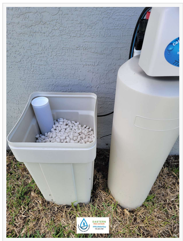
Water Treatment Services in Valencia Cay

Eastern Water and Health Eastern Water and Health +1 772-301-1767 info@easternwaterandhealth.com