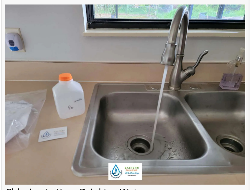
Chlorine In Your Drinking Water

Coast to better understand treatment options available to get drinking water up to par and seeks to address commonly asked questions surrounding treatment systems such as what's