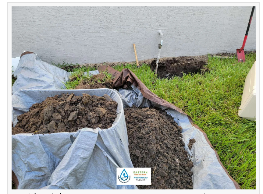
Residential Water Treatment In Port St Lucie