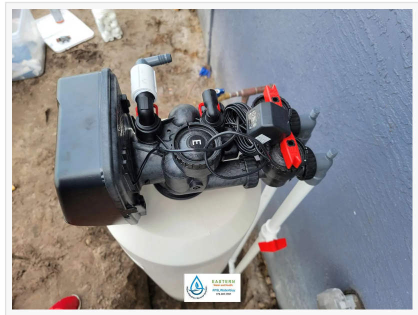
Reverse Osmosis Drinking Water For Yachts

Adding Salt to the Brine Tank - Salt is Required in the Brine Tank Salt is used by the system to create an ion exchange process. The brine tank should always have salt in it. Well, water systems typically require between 2 and 3 bags of salt per month, depending on how much water is used in the household. The more individuals within a home, the more salt will be used by the system. When purchasing salt for a system, Eastern Water and Health recommends using salt CRYSTALS, not salt pellets. These can be found in many home supply stores throughout the area or Eastern Water and Health offers a monthly salt delivery service.