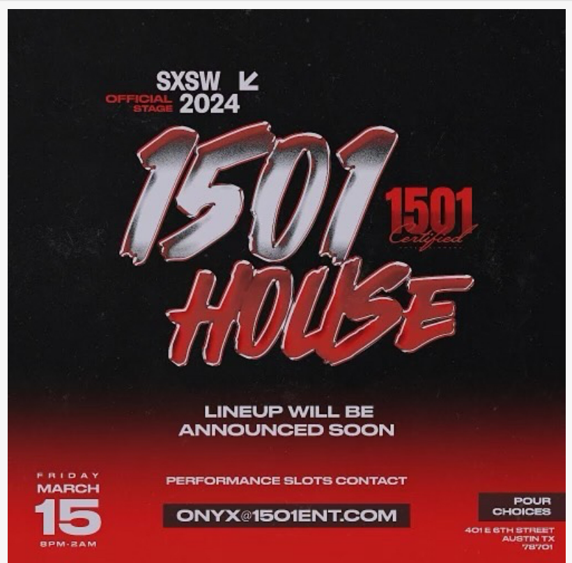
"1501 HOUSE" Official SXSW Stage Flyer 2024