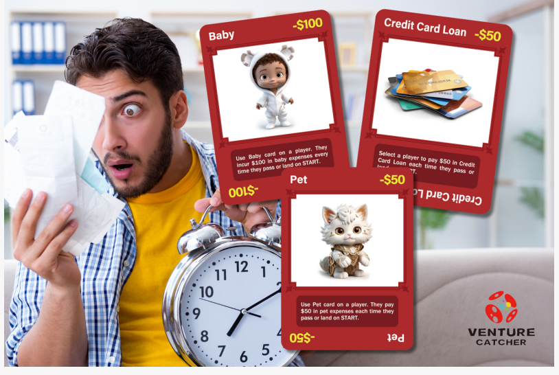
The Balance of Recurring Expenses in PAYCHECK TO BILLIONAIRE

Venture Catcher Venture Catcher Studio +1 8563953868 email us here Visit us on social media: Facebook Twitter LinkedIn Instagram YouTube TikTok Other