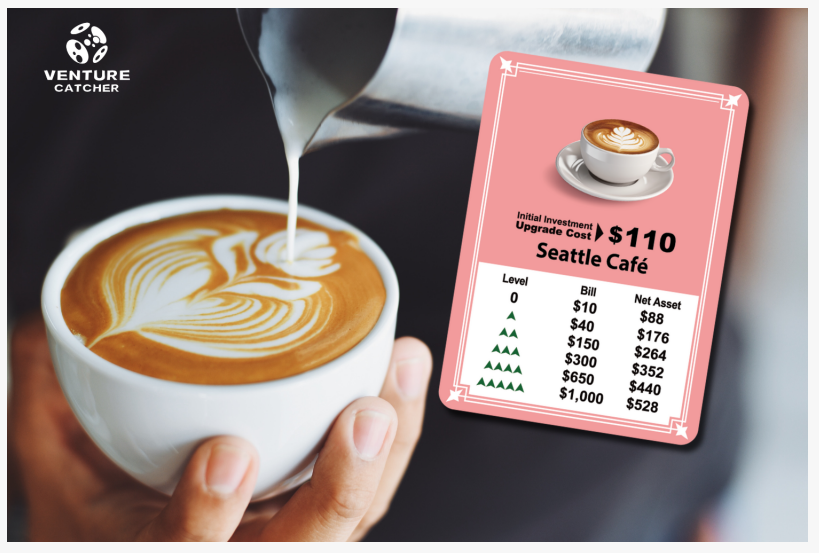
PAYCHECK TO BILLIONAIRE Board Game Mirroring the Real Life