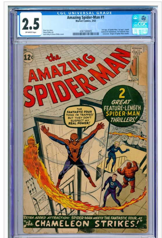
Copy of Marvel Comics Amazing Spider-Man #1 (March, 1963), graded CGC 2.5 and featuring the first appearance of J. Jonah Jameson and Chameleon (est. $3,000-$5,000).