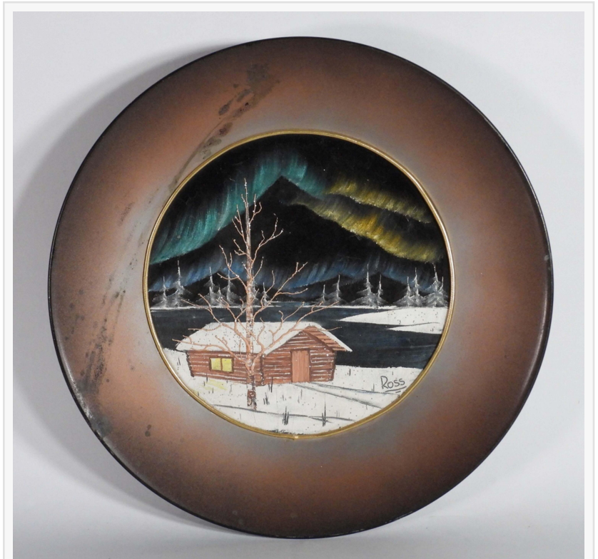
Authentic, original oil on velvet Alaskan gold pan painting by Bob Ross, (Alaska/Fla., 1942-1995), the host of TV's long-running hit series The Joy of Painting (est. $5,000-$8,000).

The second portion of the auction will feature 117 lots of sports, non-sports, and TCG trading cards in both graded and raw condition. The final portion of the catalog will consist of 518 lots of comics and comic art. Comics include a vast selection of Golden through Modern Age era books