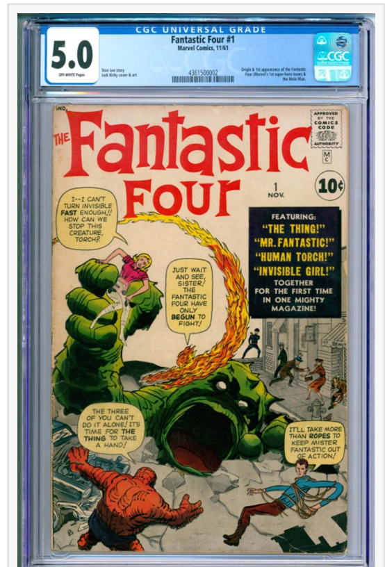
Copy of Fantastic Four #1 (lot #441), graded CGC 5.0, featuring the origin and first appearance of the Fantastic Four, plus the Mole Man (est. $10,000-$15,000).

The Bob Ross painting will be followed by 130 lots of vintage toys and collectibles. The copy of Fantastic Four #1 (lot #441) is graded CGC 5.0 and features the origin and first appearance of the Fantastic Four (Mister Fantastic, the Invisible Woman, the Human Torch and the monstrous Thing), plus the Mole Man. It should sell for $10,000-$15,000.