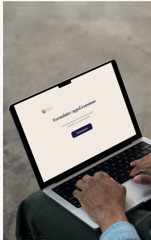
FMJF - Appel à sessions 2024