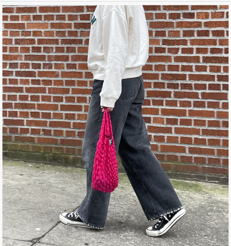
Shibori bag in action.

Also, since the shibori eco-bag does not need to be folded, it can be easily used when both hands are full. Despite its compact design, it has a large storage capacity and is extremely easy to use. And with seven different colors to choose from, anyone can find their favorite color. By choosing a favorite color, it can also be used as a fashion accent. It blends in easily as a bag for everyday use, creating a stylish atmosphere or allows anyone to coordinate it as part of their outfit.