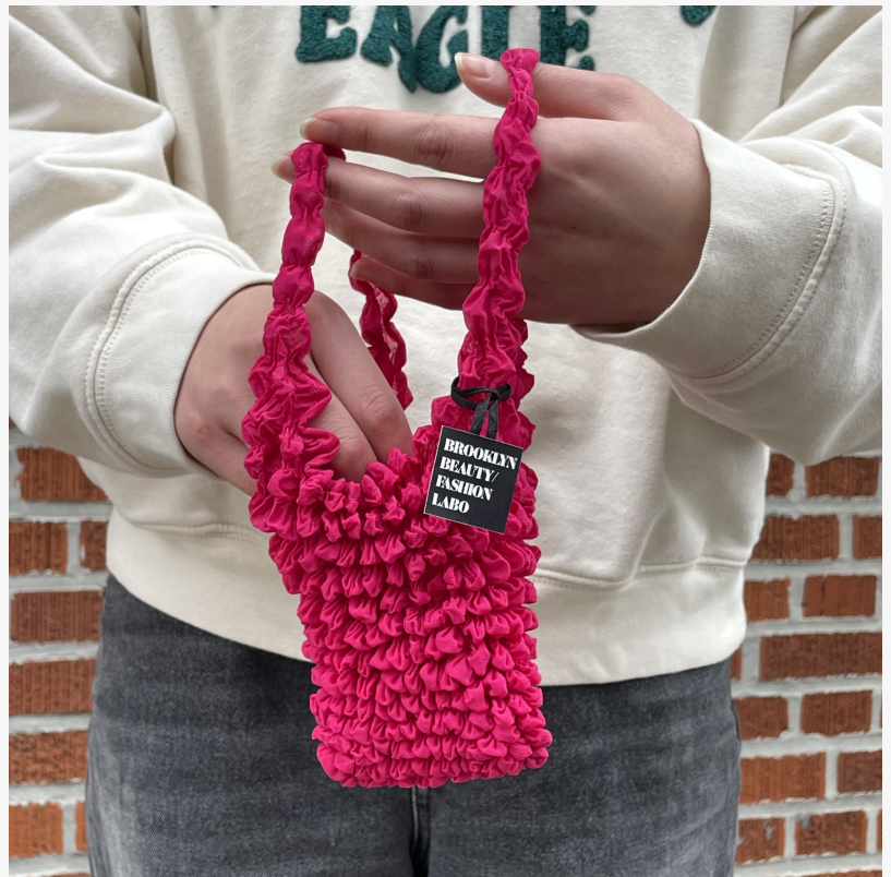
Closeups of the shibori bag.