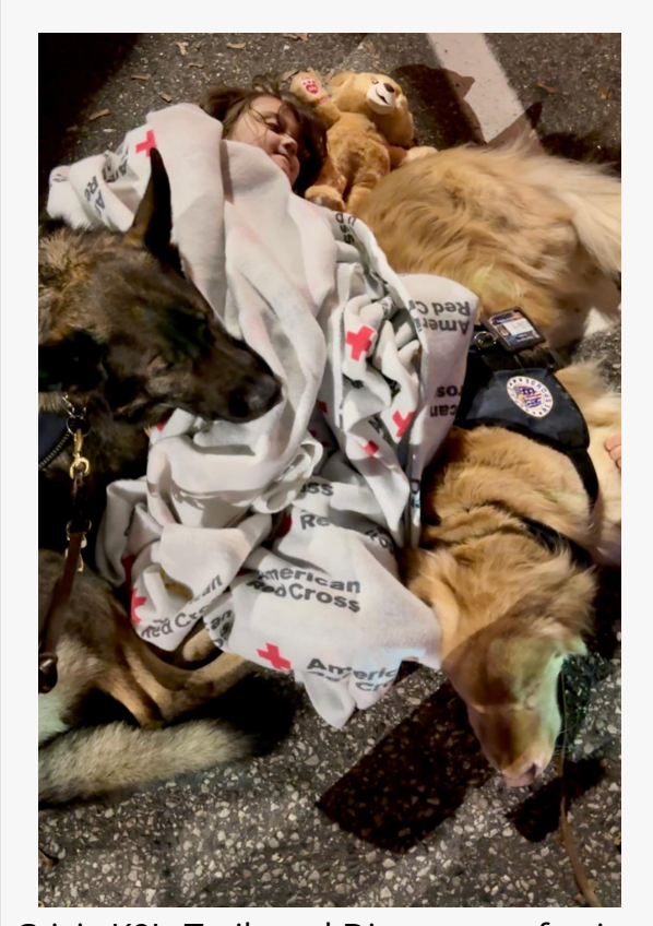
Crisis K9's Tarik and Django comforting a child in Lewiston, Maine