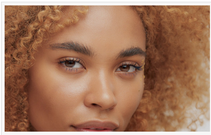
sclera-lenses.com - colored contacts

available for purchase on their website. With their commitment to quality and customer satisfaction, customers can trust that they are getting the best product for their money. So whether you want to enhance your natural eye color or try something new, Sclera-Lenses.com has got you covered.