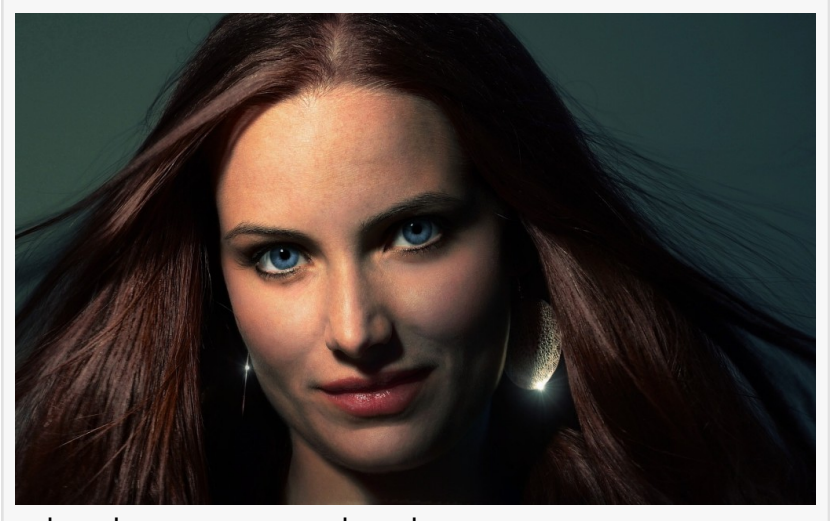
sclera-lenses.com - colored contacts

"We are thrilled to introduce our new models of prescription colored contacts to our customers," says the spokesperson for Sclera-Lenses.com. "Our team has worked tirelessly to ensure that these lenses not only provide a natural and realistic result but also maintain the highest quality standards. We understand that our customers have different preferences and needs, which is why we have a variety of options to choose from."