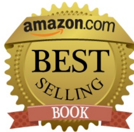
Amazon Best Seller

This press release can be viewed online at: https://www.einpresswire.com/article/689442268 EIN Presswire's priority is source transparency. We do not allow opaque clients, and our editors try to be careful about weeding out false and misleading content. As a user, if you see something we have missed, please do bring it to our attention. Your help is welcome. EIN Presswire, Everyone's Internet News Presswire™, tries to define some of the boundaries that are reasonable in today's world. Please see our Editorial Guidelines for more information.