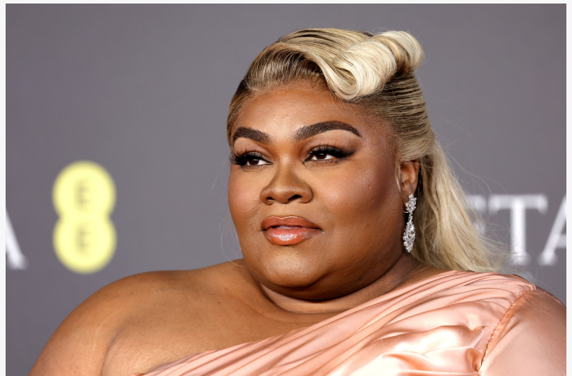
Da'Vine Joy Randolph in Moussaieff Diamond Earrings

She wore a pair of exquisite diamond drop earrings with a total diamond weight of 19.46 carats, set in white gold. They were designed with prominent pear-shaped diamonds in cluster formations and with marquise diamonds creating a tassel effect.