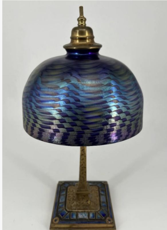
Rare Tiffany lamp

BEVERLY HILLS, CA, USA, February 19, 2024 /EINPresswire.com/ -- Kings Auctions Beverly Hills with Kings Auctions Las Vegas is preparing to sell Michael Jackson's personal collection of hand drawn, signed art that has previously been deemed "The Museum Collection". This multi million dollar collection is being sold by court mandate after many years of court hearings and will be available to exclusive bidders around the world. Kings Auctions was the choice of the court due to their history with rare celebrity owned merchandise and Hollywood memorabilia. The collection includes all types of drawings by Jackson himself. Fans of Jackson and art enthusiasts alike are sure to be interested in this unique opportunity to own a piece of history. With bidding set to begin in early 2024 buyers will soon be able to view the iconic collection. So whether you're a fan of Jackson's music, or an investor be sure to keep your eye on this upcoming auction.