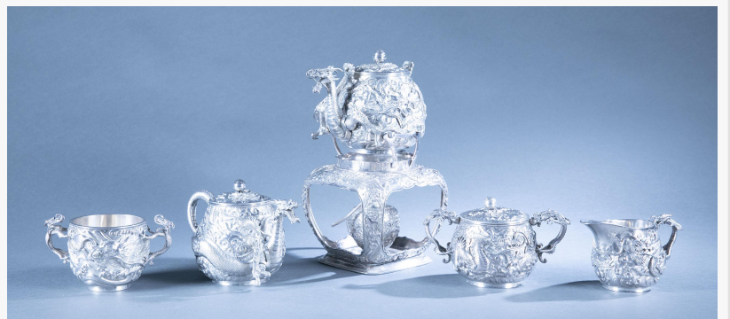
5-piece Chinese Export sterling silver tea set with high-relief dragon-and-cloud pattern. Total weight: 65.60ozt. Estimate: $3,000-$5,000