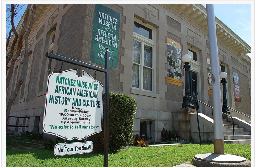
The African American Museum of History and Culture contains exhibits from a number of Natchez related African American historic sites, important citizens and events.

Founded in 1716, The City of Natchez, Mississippi, prides itself on being the oldest city on the