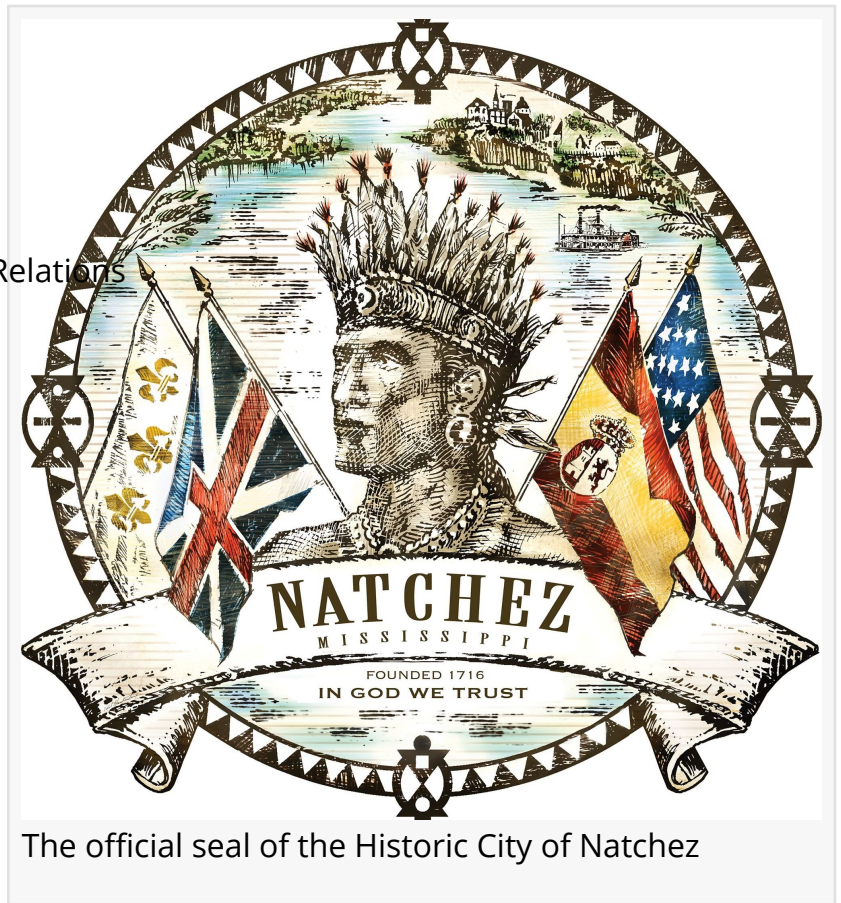
The official seal of the Historic City of Natchez

This press release can be viewed online at: https://www.einpresswire.com/article/689593670