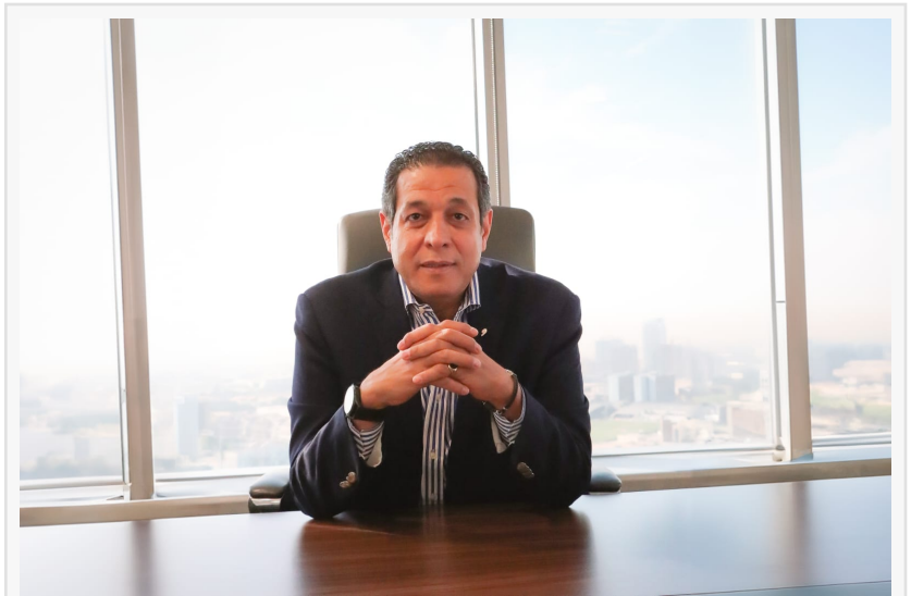
TIME Hotels Chief Executive Officer

For reservations and more information, please visit TIME Ruba Hotel & Suites or contact welcome.ruba@timehotels.com .