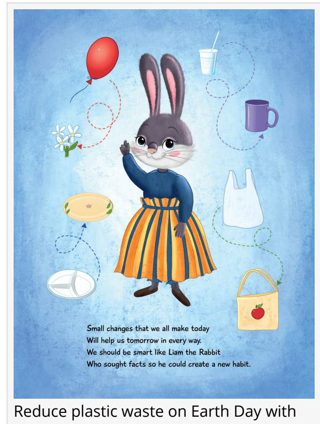
Reduce plastic waste on Earth Day with Liam, the Smart Rabbit!

In support of the book and its mission, Jana Koebel, co-founder of Seas & Straws says "Reduce, Reuse, Recycle with Liam the Smart Rabbit is a beautifully told story about plastic pollution and its impact on forest wildlife. In captivating, powerful, yet easy-to-understand rhymes, it shows how harmful modern human lifestyles are to the creatures of the forest, while teaching our little ones to love, respect, and care for all animals and their habitats. I absolutely loved the story, and the poetry is outstanding and full of personality! I have read it over and over again. Highly recommended for anyone who wants to nurture a love of nature and its inhabitants in their children".