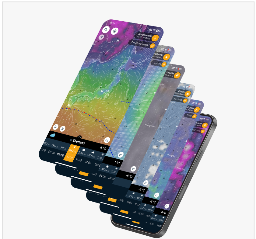
Map layers dedicated to various weather data

Facebook Twitter LinkedIn Instagram YouTube