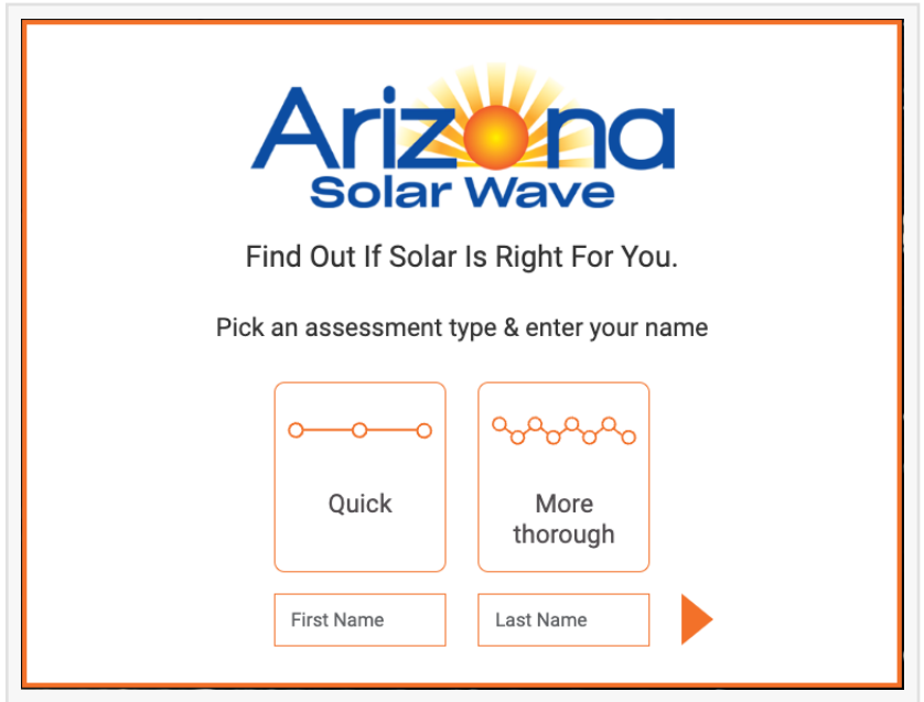
ASW Solar Calculator

Arizona Solar Wave's consultative process strives to help residential homeowners attain the best return on investment as they transition from fossil fuels to clean, renewable, solar energy. Its team of highly trained advisors assist customers to size the solar system to custom fit their home, explore several financing options, and make a recommendation based on the customer's best interests, discuss tax credits that may be available, and highlight the expected short, medium, and long-term savings — even the