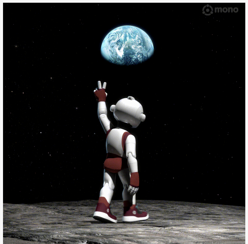
MONO MARS Seeing Earth From the Red Plan

3. Expansion of Creative Team: By raising funds through Kickstarter, MONO MARS plans to expand its creative team, bringing together top talent in digital artistry, animation, and storytelling to create compelling content that resonates with its global audience.