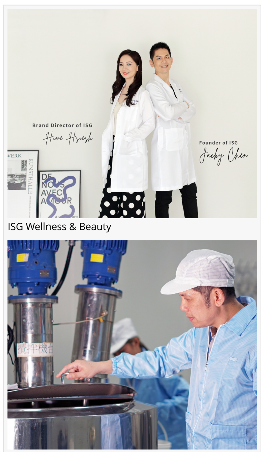
ISG Wellness & Beauty

BioSkin, a flagship product of ISG, stands at the forefront of skincare innovation. This product, praised by skincare experts, incorporates highend imported ingredients with