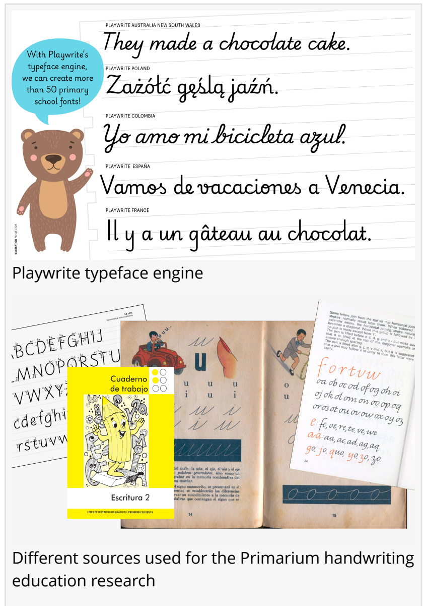
Different sources used for the Primarium handwriting education research

The project was initiated by TypeTogether, an internationally awarded type foundry established