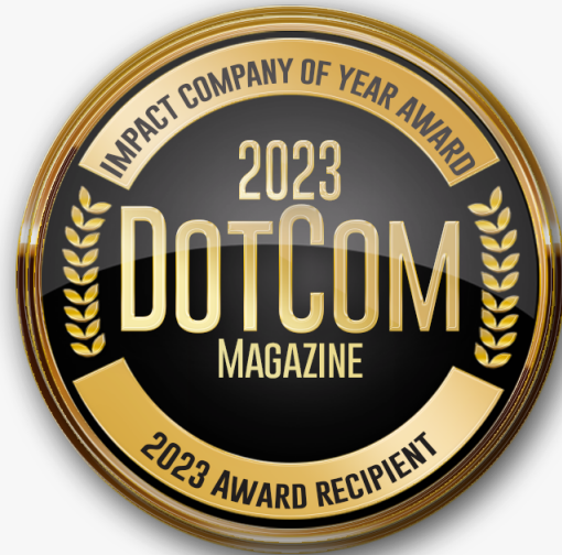
The DotCom Magazine Entrepreneur Spotlight Series- Impact Company

the newsworthiness of the story and what our viewers want to learn about. If something is important to our viewers, it is important to DotCom Magazine. The people at DotCom Magazine believe in including a diverse range of entrepreneur voices in our interviews, and actively pursuing entrepreneurs making a positive difference in the world.