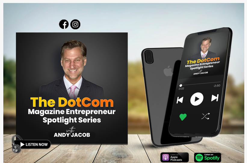
The DotCom Magazine Entrepreneur Spotlight Series-Cover Story