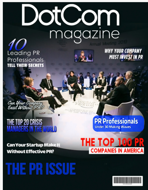
The DotCom Magazine Entrepreneur Spotlight Series- The Power Of Video