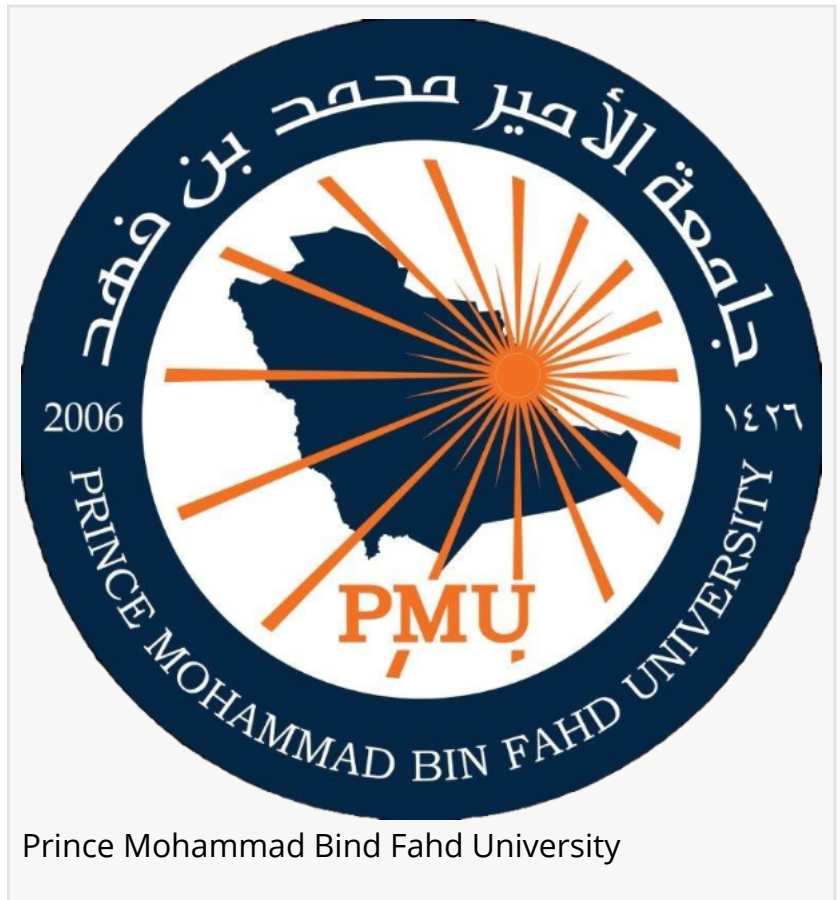
Prince Mohammad Bin Fahd University

The student club scene at PMU is similarly diverse. A partial list of the topics explored at PMU clubs currently or in recent years includes finance, public speaking, books, law, media, technology, chess, community service volunteering, sustainability, traffic safety, and arts &