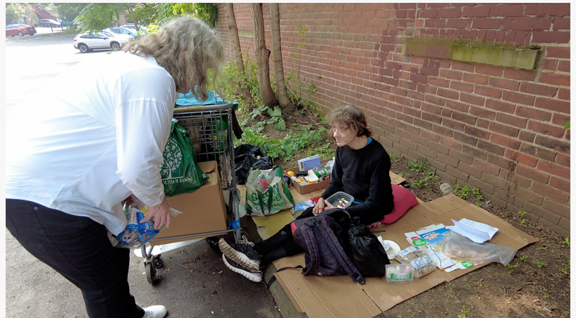
Homeless in Connecticut