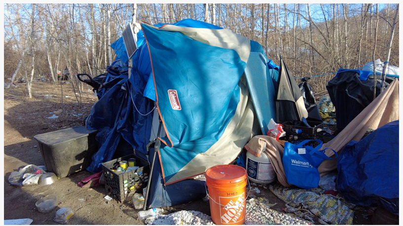
Homeless mans home.