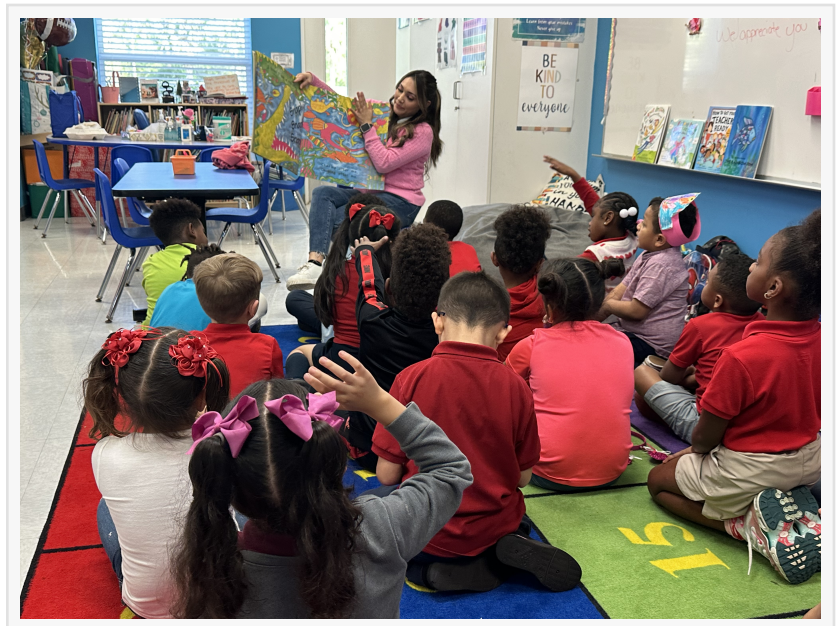
Community Foundation Launches Early Literacy Fund

"The Community Foundation has been a voice of leadership in supporting local nonprofits that are working hard