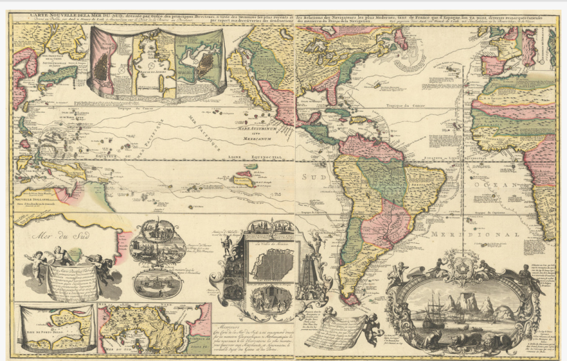
Extraordinary 1740 map of the Americas and surrounding oceans by Andries & Hendrik de Leth titled Carte Nouvelle de la Mer du Sud , one of the most decorative ever engraved ($20,125).

RICHMOND, VA, UNITED STATES, February 21, 2024 /EINPresswire.com/ -- A rare and important early first state map of the Carolinas from 1685 sold for $29,325 and an extraordinary map of the Americas and surrounding oceans from 1740 rose to $20,125 in Old World Auctions' online-only Auction #196, which went live on January 24th and ended on February 7th. Nearly 800 lots came up for bid in the auction, which totaled $420,277.