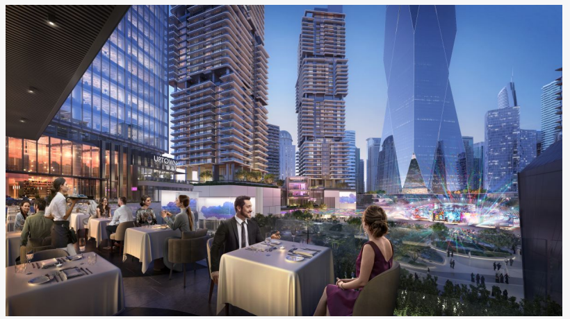
Uptown Dubai development terrace

“We are honoured to have been selected to partner with DMCC on the next phase of this prestigious development, which is of strategic importance to activating the Uptown Dubai Masterplan.”