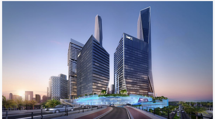
Uptown Dubai development from ground level, image by BSBG