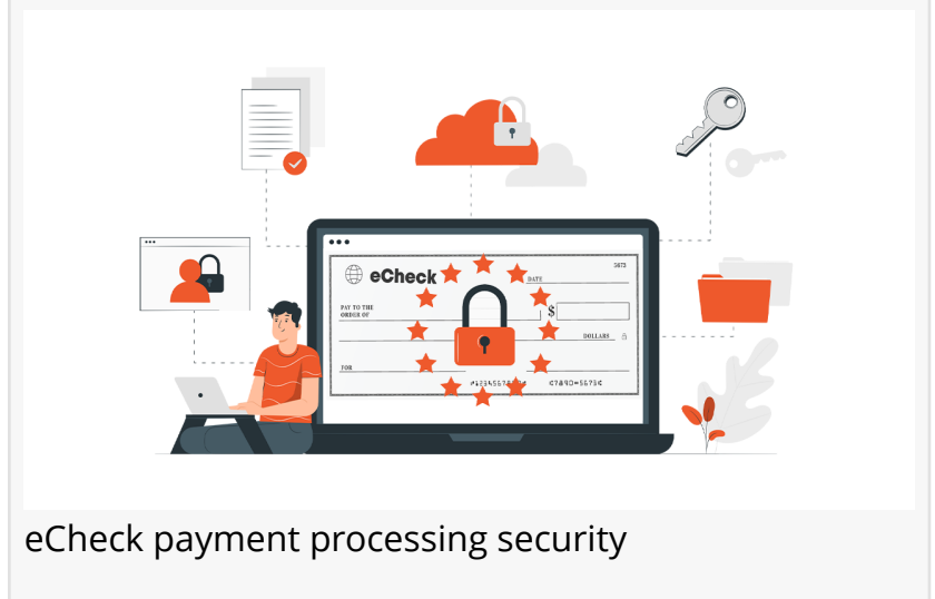
eCheck payment processing security