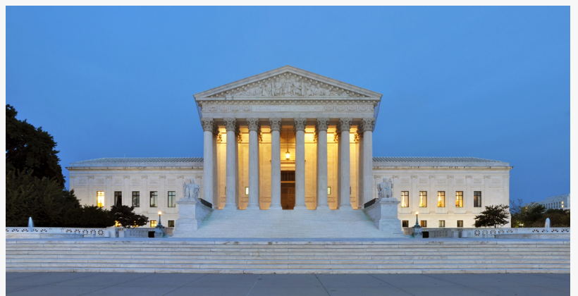
US Supreme Court Building, WASHINGTON DC

MOUNT PLEASANT, SC, UNITED STATES, February 22, 2024 /EINPresswire.com/ -- Reach Local Lawyers Rebrands and Announces Grand Opening Under Results Driven Marketing ® Ownership