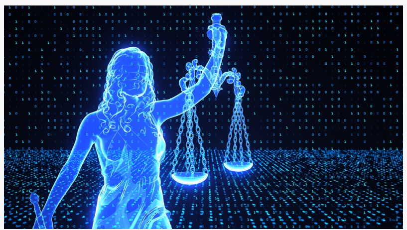
Digital Lady with scales of Justice