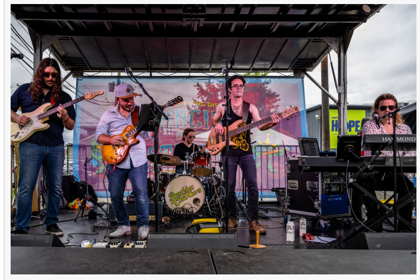
One of the many bands to enjoy at Dancing in the Streets.