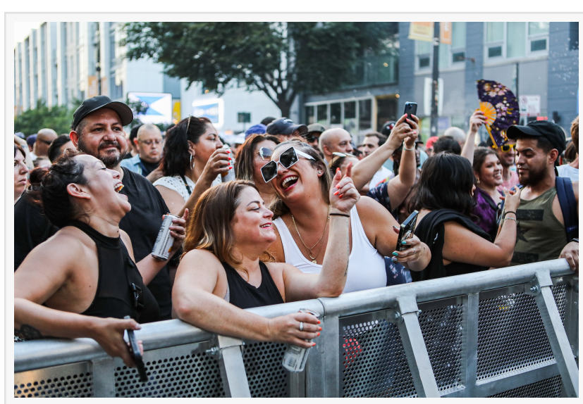
Festival goers dance front row at West Fest Chicago.

CHICAGO, ILLINOIS, UNITED STATES, February 21, 2024 /EINPresswire.com/ -- Summer festival season is fast approaching and the West Town Chamber of Commerce is thrilled to announce the dates for this year's festival lineup! These special events are produced independently by the Chamber in benefit of the community, and include Do Division Street Fest (May 31-June 2), West Fest Chicago